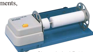
Chart winder LB-23

For long-term measurements, a chart winder with a matching design is available.