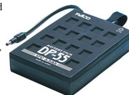
Rechargeable battery pack DP-1240

The LR-07 can be powered from two kinds of dry-cell batteries, two kinds of rechargeable battery packs, a car battery or an AC adapter. This makes it ready for use in any situation.