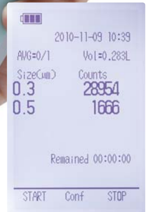
2 channels display (KC-51)