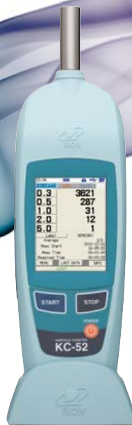
Unit in stand