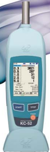
Unit in stand